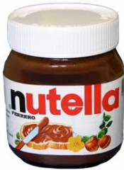
NUTELLA® and the relevant devices and indicia are trademarks owned by FERRERO®.

Different businesses adopt different approaches, depending on their branding strategy. Whatever your choice, make sure that your trademark is registered for all classes of goods/services for which it is or will be used.