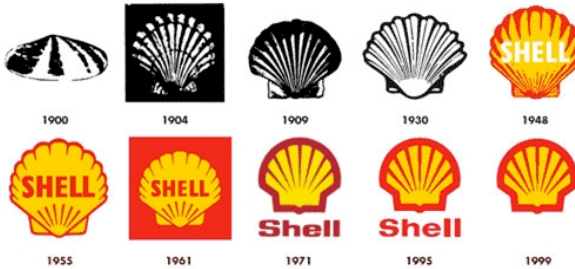
The SHELL® logo is property of the Royal Dutch Shell group of companies.

Many trademarks have changed slightly over the years in order to modernize the image of a business or adapt to new advertising media. You will have to consult with the trademark office(s) concerned or a trademark agent as to whether a specific change will require the submission of a new application and payment of relevant fees.