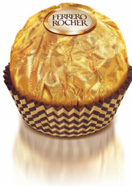
The FERRERO ROCHER® trade-dress is a trademark owned by Ferrero.

often serves the same function as a trademark – identifying the source of products in the marketplace – in some countries it can generally be protected under trademark laws, and in a few countries it can be registered as a trademark. Depending on your country, if trade dress cannot be registered as a trademark, it may nonetheless be protectable under unfair competition laws or actions for passing off.