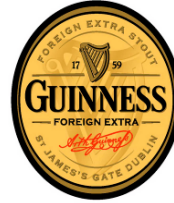
Label for GUINNESS® Foreign Extra Stout by Diageo Ireland.

which charges its operating companies (in high-tax jurisdictions) royalty fees for the use of the trademarks.